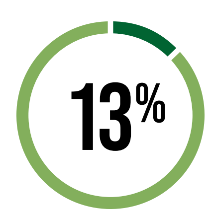
to divide assets fairly and have not spoken openly to their spouse about their plans